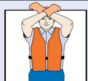
Closed forearms indicate STOP.