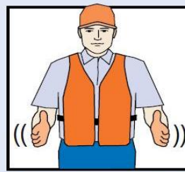
Distance to go (palms apart indicating how far).