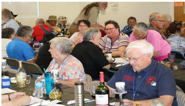
Eating and socializing, what we do best.