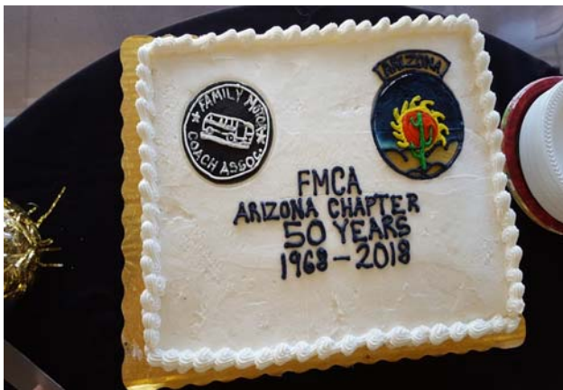
Our 50 year celebration cake